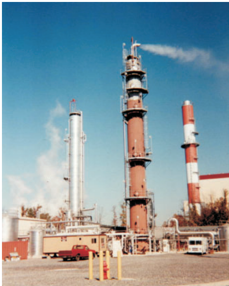
CO 2 capture at AES Warrior Run power station in Cumberland, MD, USA.

based on current technology. It is expected that wide-spread application of this technology would result in developments leading to a considerable improvement in its performance. The cost of avoiding CO 2 emissions is 40-60 US$/tonne of CO 2 (depending on the type of plant and where the CO 2 is stored), which is comparable to other means of achieving large reductions in emissions.